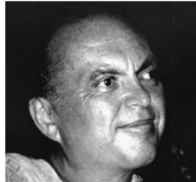
Avatar Adi Da Samraj, 1987