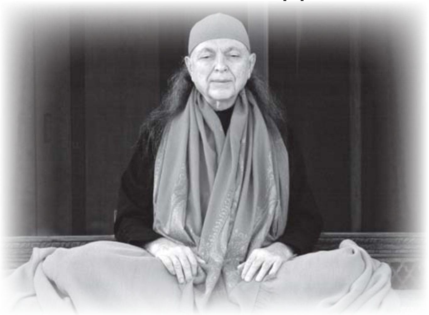
Avatar Adi Da sitting with devotees, July 2008

Conditions or “experiences” themselves do not determine (or “define”) you. The Divine does. If you live in the Divine, any event, any apparent condition, ceases to condition your quality and your humor and make it something less. So one who has become Free in the Divine is Truly Free. Such a one no longer has concerns about whether he or she will appear or not appear, in what shape he or she will appear, or anything like that. Such a one is Happy, and the Divine is Sufficient for that individual. That is the Condition to be in.