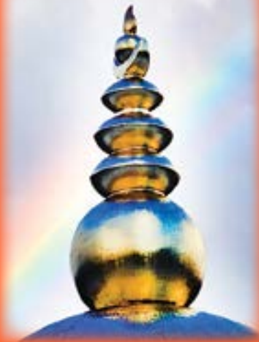
The "Brightness" Spire (with rainbow)

There is no bodily "thing" to be accomplished.